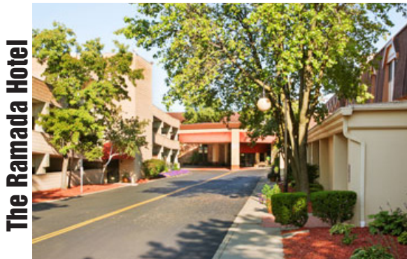
The Ramada Hotel

We hope you'll join us in Ohio and we look forward to sharing our software insights with you!